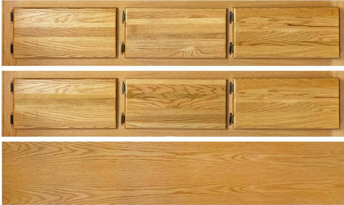
2 - 3 Door Side Panels and 1 Footboard