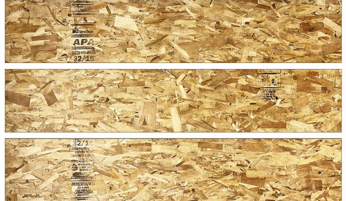
1 Head Panel Board & 2 Center Support Boards